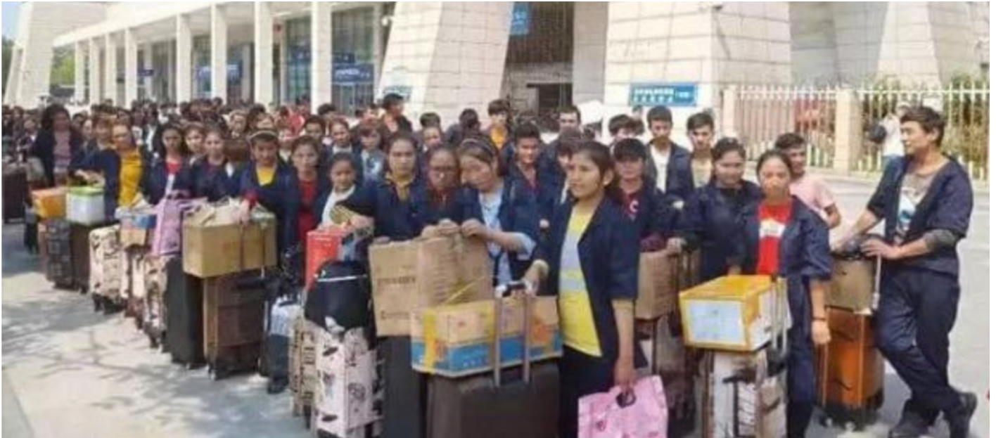
The Chinese government transporting Uyghur, Kazakh and other Turkic Muslim youth out of East Turkistan to work in factories in China proper.