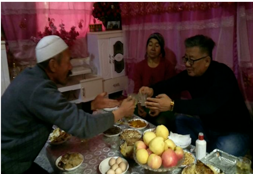
A visiting Han civil servant asks a Uyghur villager if he smokes or drinks liquor, and the two drink together. This image was posted on social media platform Meipian by the Han civil servant in a diary article about his homestay experience.

In an effort to change the demographic structure of East Turkistan, the Chinese government sends Uyghurs to work in forced labor facilities in mainland China.