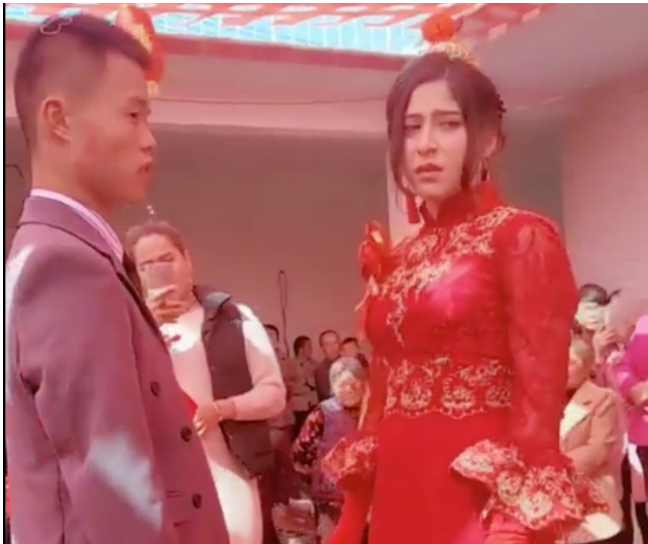
Uyghur woman forced to marry a Han Chinese man.

Having young Uyghur girls forced to marry Han Chinese men is a step towards changing the demographics in East Turkistan, in particular, as a result of the Chinese who come to stay in Uyghur houses as permanent guests and marry the young girls living there. Parents are unable to object to the marriage because if they do, they are sent to the camps. In order to disrupt the Uyghur family structure, the Beijing administration offers the Han Chinese money, jobs, and free homes for these arranged marriages. The Communist Party successfully spreads propaganda through films and advertisements and other broadcasting organs in order to recruit candidates for the forced marriages.[19] The government goes a step further and employs social security officers for the weddings. The purpose of the officers is to guide the Han Chinese men during the wedding and to 'persuade' the meeting of the Uyghur girls and their families. Uyghur men are constantly broadcasted as 'terrorists' by the Chinese Communist Party through heavy propaganda methods. On the other hand, Uyghur women are advertised as 'sexual items.' This is another method of forcibly changing the family dynamic and the living conditions in the region.[20]