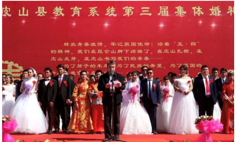
Uyghur women are forced to marry Han Chinese men in group ceremonies under the watchful eye of the CCP to make sure total compliance from the Uyghur women and their families.