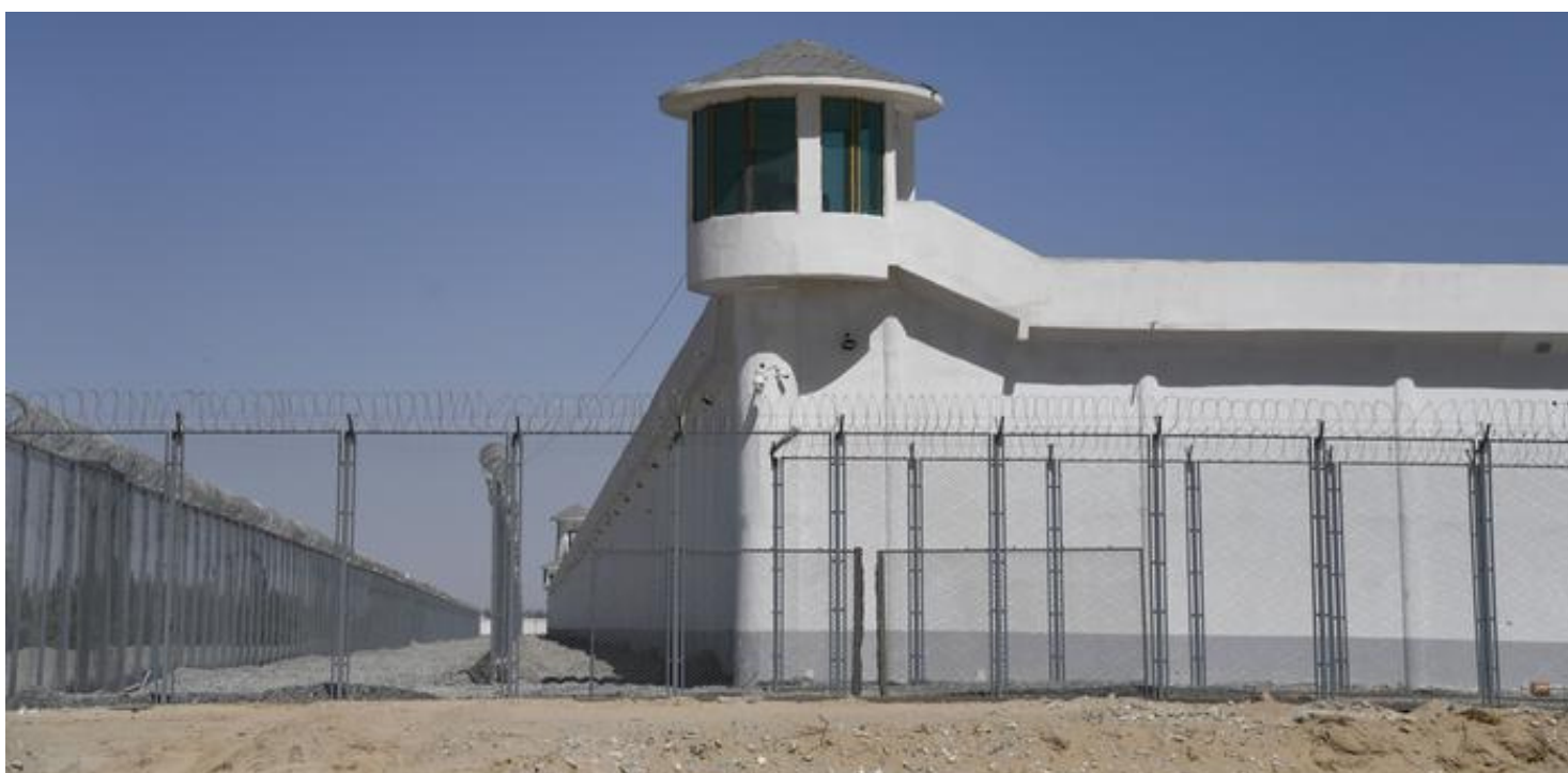
A concentration camp with a watch tower with fencing and barbed wire where Uyghurs, Kazakhs and other Turkic Muslims are arbitrarily detained. This camp is located on the outskirts of Hotan, East Turkistan.

Withal, China targets millions of Uyghurs, eliminating them and holding them in concentration camps and prisons in the 21st century. One of the most striking aspects of the convention is that the destruction of a part of the group as a victim, not all of it, is sufficient to commit the crime. At that point, when the targeted group has been determined, it is necessary to consider both the qualities and quantities. Qualitatively, the elimination of the majority of the group, that is, the comparison between already targeted number and the number of survivors is considered as a benchmark. If a reasonable rate is achieved, this will be considered sufficient to qualify as a genocide. The quality refers to the type of people targeted; group leaders, prominent individuals and important figures.[9] The majority of the people targeted and sent to camps in East Turkistan are poets, professors, academics, writers and leading figures. Meaning, the list of acts which constitute genocide in the convention are done 'in whole or in part' in East Turkistan.