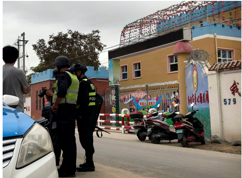
China is placing Uyghur children in Chinese state-run orphanages even if their parents are alive. The schools are equipped with barbed wires, watch towers and armed guards. @Independent