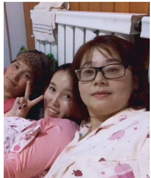
Two sent-down “relatives” share a bed with their Uyghur host. The image was posted by the Xinjiang Communist Youth League on the social media platform WeChat.