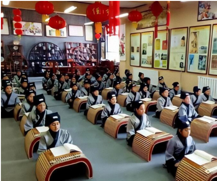
Uyghur children indoctrinated in Chinese state-run orphanages. These kids are taken from their parents who are alive, but have been placed in concentration camps and/or forced labor facilities