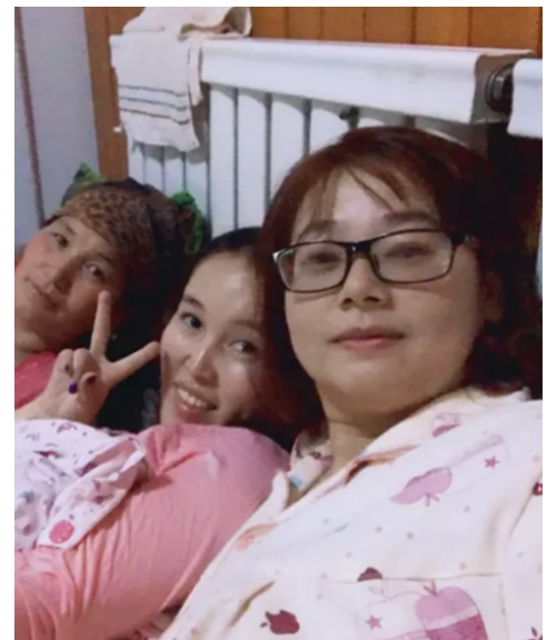
Two sent-down “relatives” share a bed with their Uyghur host. The image was posted by the Xinjiang Communist Youth League on the social media platform WeChat.