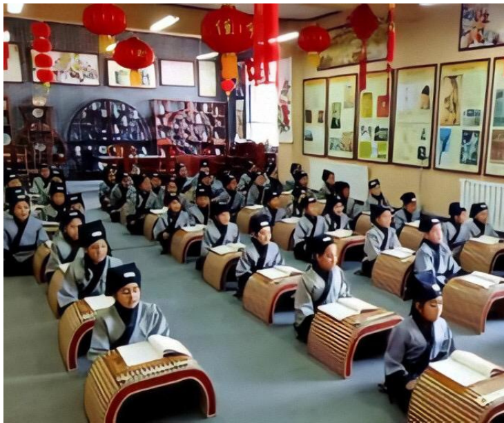
Uyghur children indoctrinated in Chinese state-run orphanages. These kids are taken from their parents who are alive, but have been placed in concentration camps and/or forced labor facilities